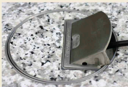
Ref 7RS, diameter 127mm to accept a single outlet

127mm diameter box accepts a single socket or outlet: